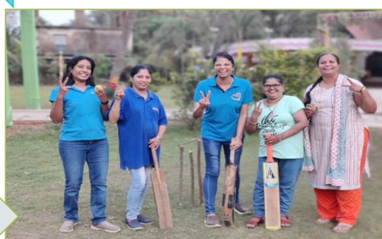
PROJECT – SARASGAD TRAKE COURAGE & ENTHUSIASM AT TOP

ONGOING PROJECT – EMPOWERING WOMEN BOX CRICKET RPL (ROTARY PREMIER LEAUGE)