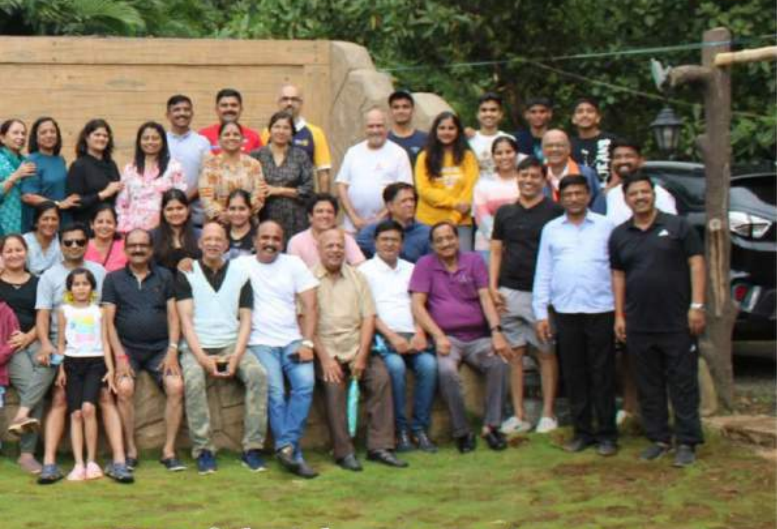
Raanfula Adventures Aug 2024