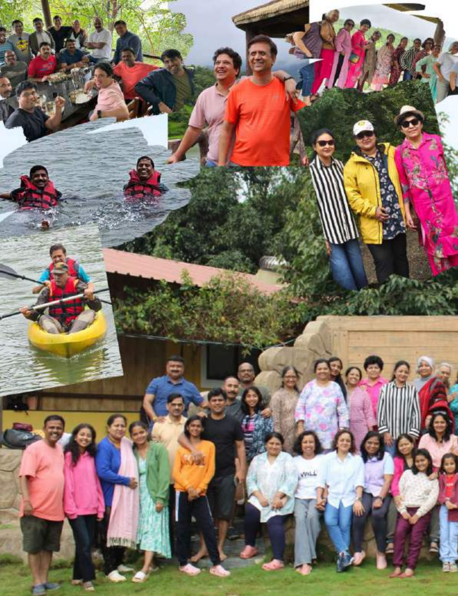
Monsoon picnic Anns meet