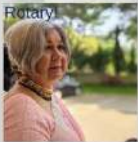
From the Editor

It's satisfying to see a month packed with productive projects, where inspiration meets action, and where we appreciate how much we can achieve together. Here's to a September filled with more wit, wisdom, and wonderful work through