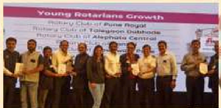
Young Rotarians Growth