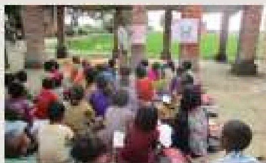
Students learn the alphabet in the open-air school structure.