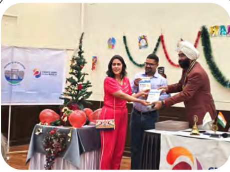
Handing over Of RC Poona flag to visiting Rotarians from Brazil