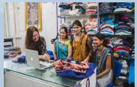
Womens career got lift from Rotary Dist 3131