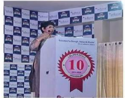
At the Jadhavar College Training Seminar by Rotary Club of Pune Lokmanyagar