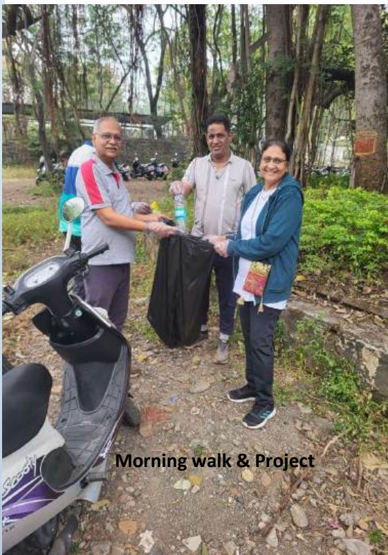
Morning walk & Project