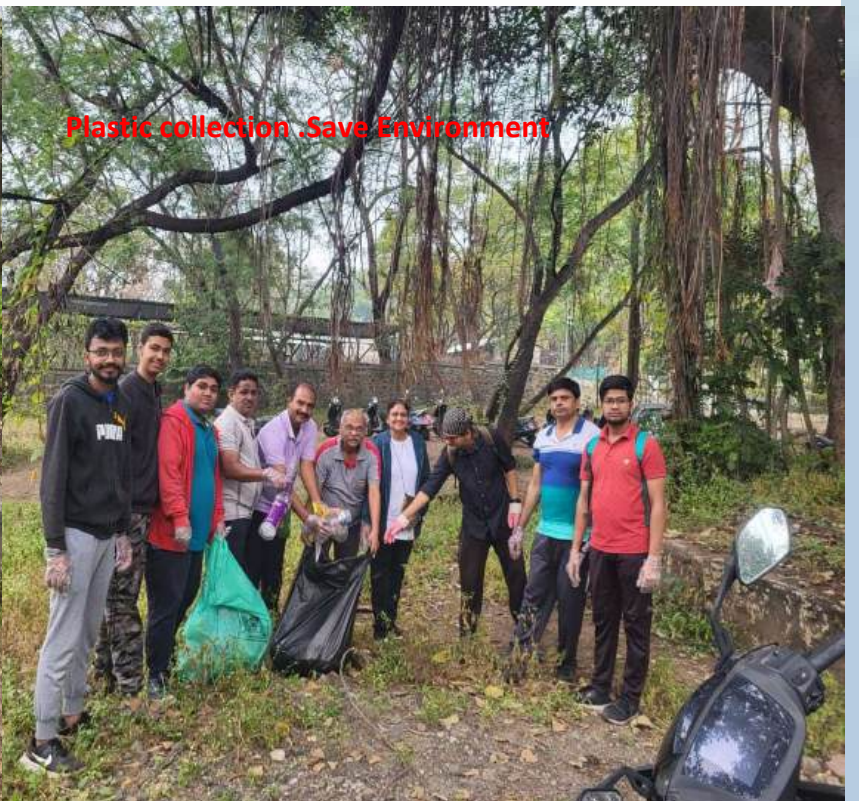
Plastic collection .Save Environment