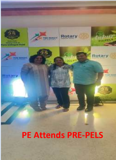
PE Attends PRE-PELS