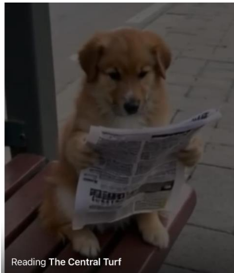
Reading The Central Turf