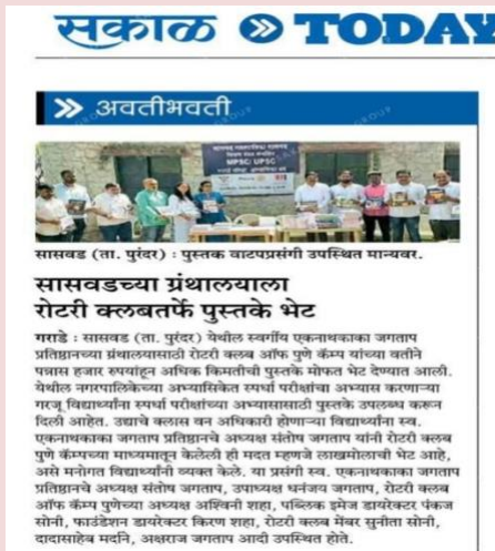
Press Release of our club project