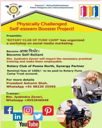
Project Atmanirbhar second batch started on 15 th of February

7 th February 2021 – Breakfast Meeting at YUMMA Swami, Mukund Nagar