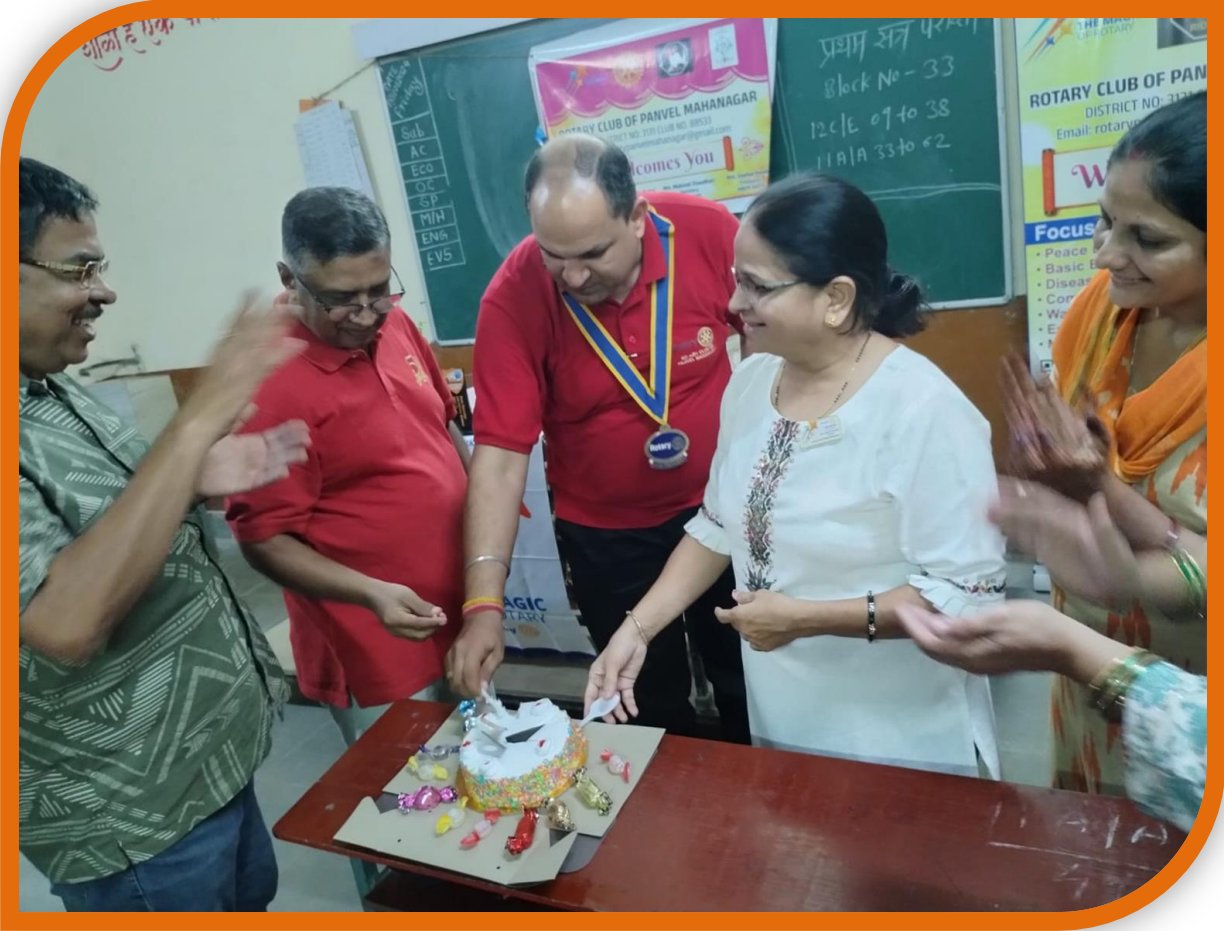
The Rotary Club of Panvel Mahanagar celebrated October birthdays in a weekly meeting, creating a warm and joyful atmosphere that strengthened fellowship and brought members closer in shared celebration.