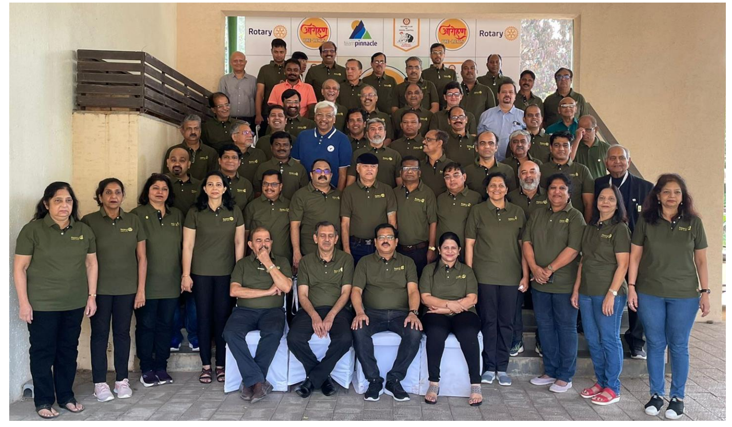
'Presidents - Elect' District 3131 - RY 22-23