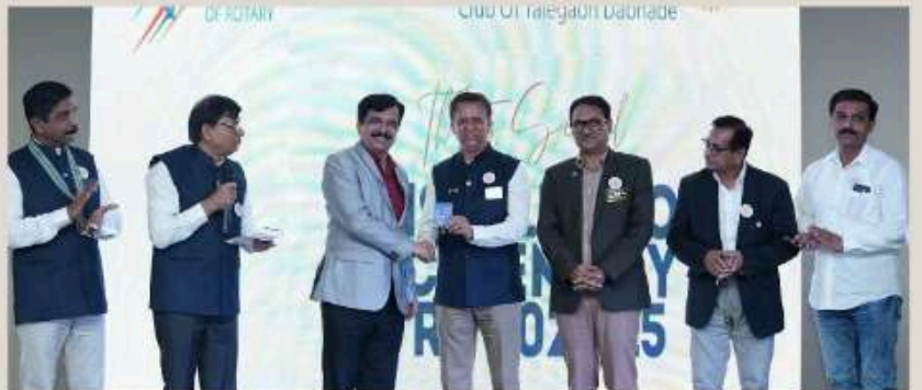
Rotary Foundation Collection