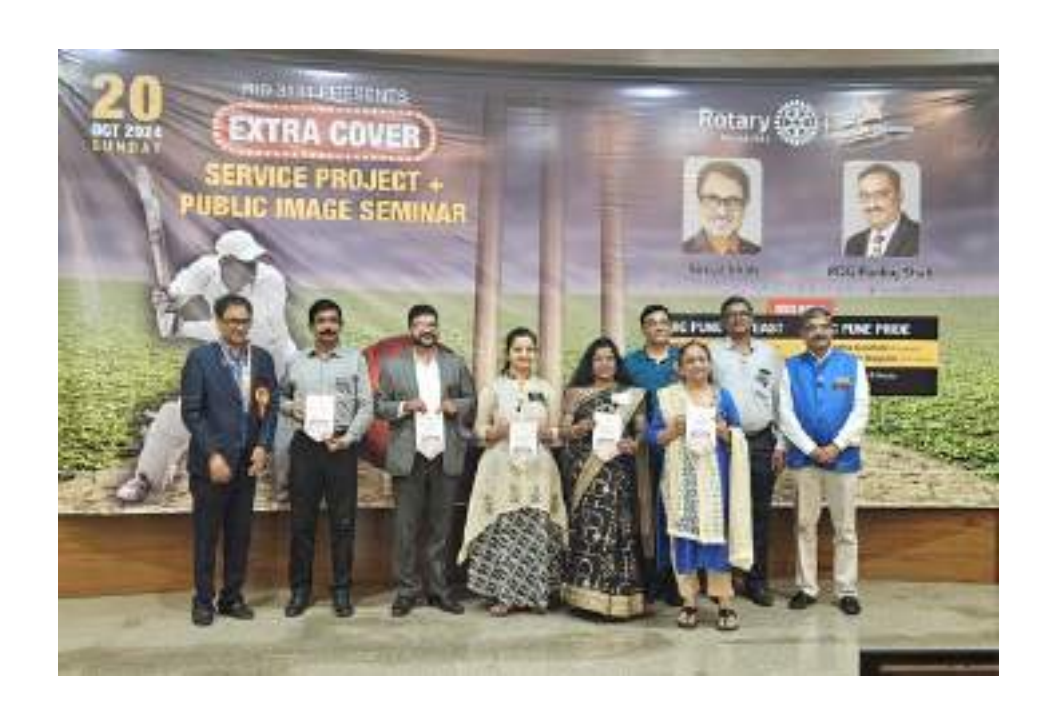
RC Chinchwad-Pune getting Recognition for forming 2 ROTARY Community Corps Clubs.