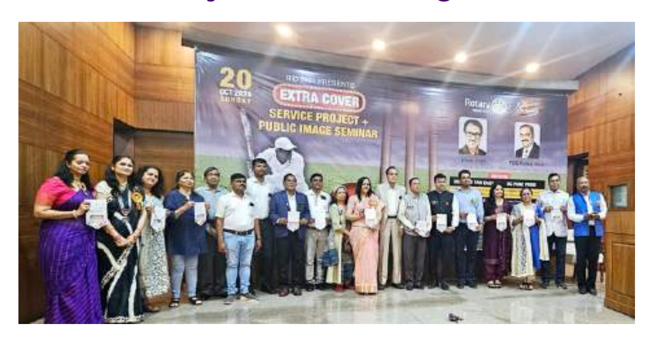
RC Chinchwad-Pune getting Recognition for doing remarkable work in Environment Avenue for participating in mega tree plantation