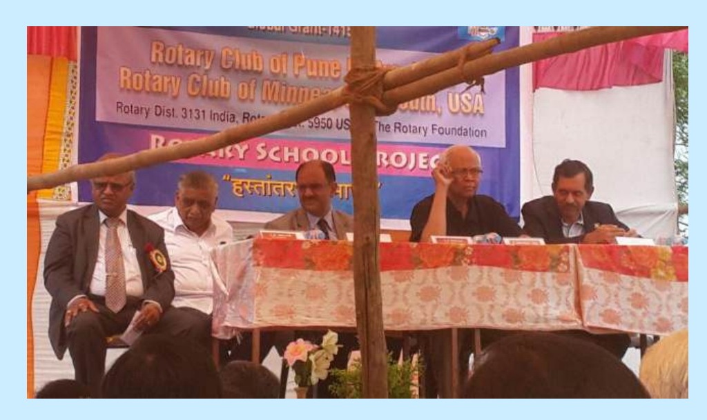
Completion of first global grant project