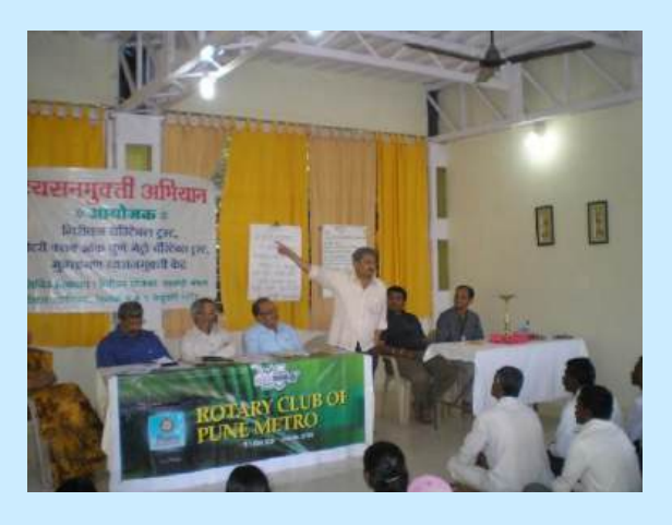
Deaddiction workshop at Girivan