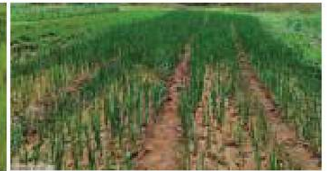
Improved paddy cultivation