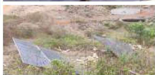
Solar lift irrigation and open well