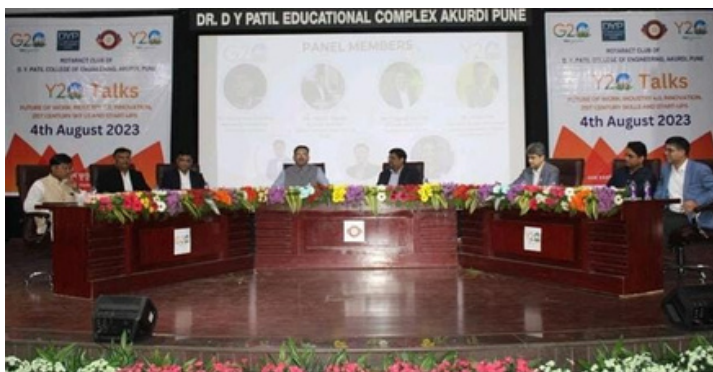
Second Half : Panel Discussion with the industry Experts

The Rotaract Club of DYPCOE (DY Patil College of Engineering) in collaboration with our Parent Rotary Club of Pradhikaran successfully organized the Y20 Summit on August 4th, 2023. The event garnered attention as it brought together a remarkable assembly of esteemed individuals, aiming to discuss pertinent topics related to innovation, sustainability, and industry insights.