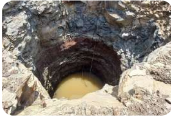
Inauguration of Water Well @ Bhogewadi Solapur