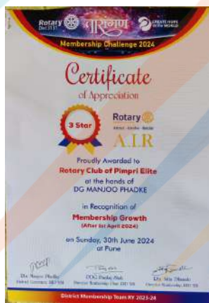
3 Star Award for Membership Growth