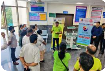
Donation of Baby Warmer @ Jijamata Hospital