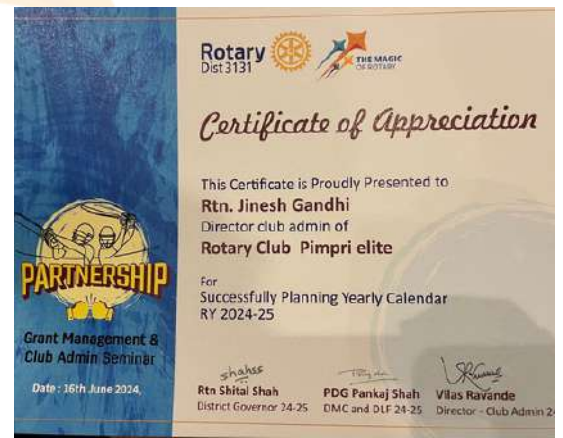
Appreciation Certificate For Admin Team RY 24-25