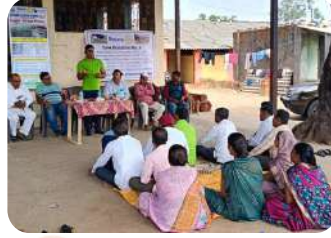
GG Project Cow donation @ Ardav Shivane, Maval