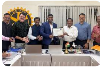
Joint Board of Directors meeting