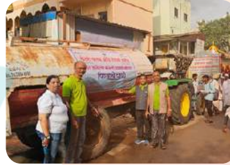
Water Tanker Donation (RY 24-25)