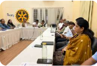
Planning Assembly RY 24-25