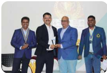
Family Night- Club Award Night