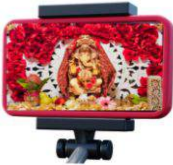
गणेशजी सजावट सेल्फी

कलात्मक व पर्यावरण पूरक सजावटीची एक व तुमच्या बाप्पांबरोबरची एक अशा दोन सेल्फी पाठवा. विजेत्यांना रोख बक्षीसे देण्यात येईल. दोन सेल्फी पाठवण्याची अंतिम तारीख १५-०९-२०२४ ही स्पर्धा रोटरीयन व नॉन रोटरीयन्स साठी आहे. पुरुष व महिलांनी पारंपारिक वेशभूषेतील सेल्फी पाठवा.