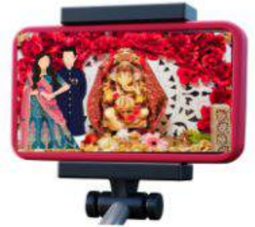
गणेशजी तुमच्या सेल्फीसोबत

सहभागी होण्यासाठी कृपया इव्हेंट ग्लिंट फॉर्म भरा