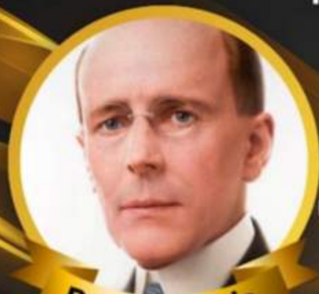
Paul P. Harris