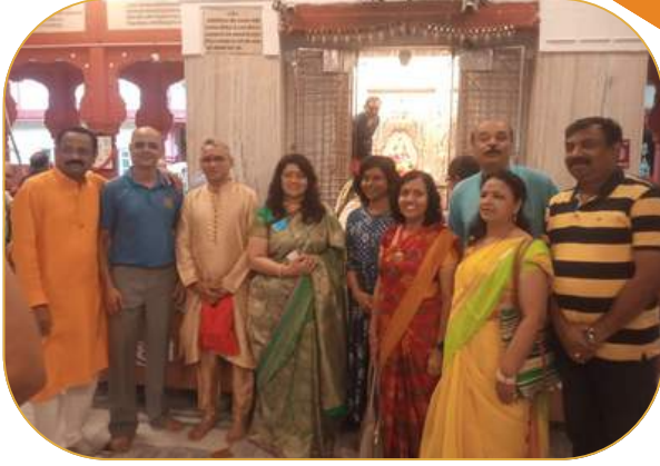
Atharva Shirsh Pooja at Sarasbagh Ganpati Mandir 1st July 2023