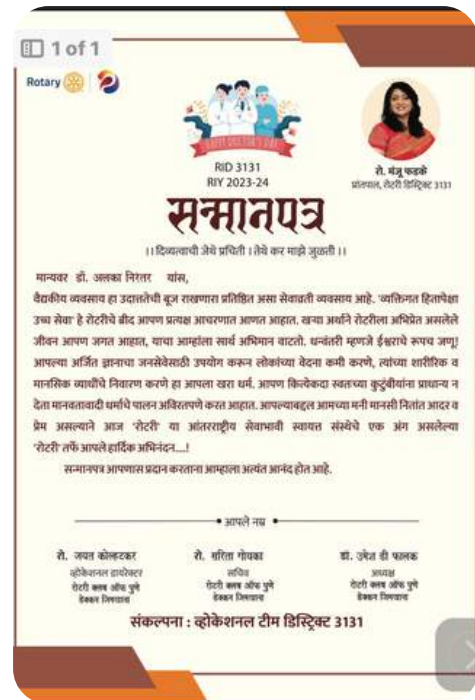
1st July - Doctor's Day, CA Day - Felicitation to members 1 Jul 2023

Celebrating our Rotary Club of Pune Deccan Gymkhana Doctors on Doctor's Day and CA Day