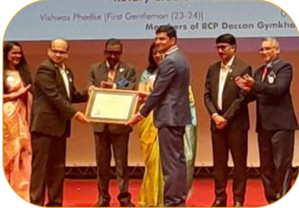
DG, President, Secretary and BOD Installation 2nd July 2023